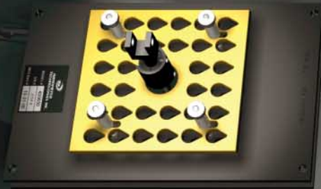
UNI-32 - 32 Position FC / SC / ST / ESCON / FDDI / DIN and most 2.5mm ferrule