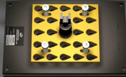
UNI-24 - 24 Position FC / SC / ST / ESCON / FDDI / DIN and most 2.5mm ferrule