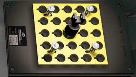
LC & MU - 24 Position