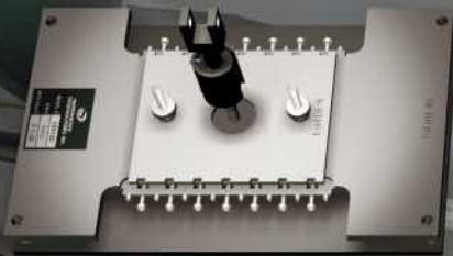
MT - 14 Position (Available in APC style)