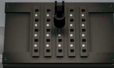
LC 'Snap-in' - 24 Position