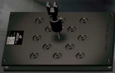
FC/APC - 12 Position