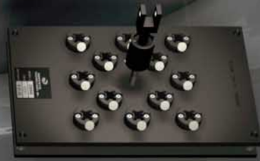
SC/APC - 12 Position