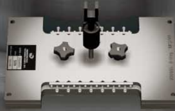
V-Groove Glass Capillary (1.8 ferrule - 8 degree) - 24 position